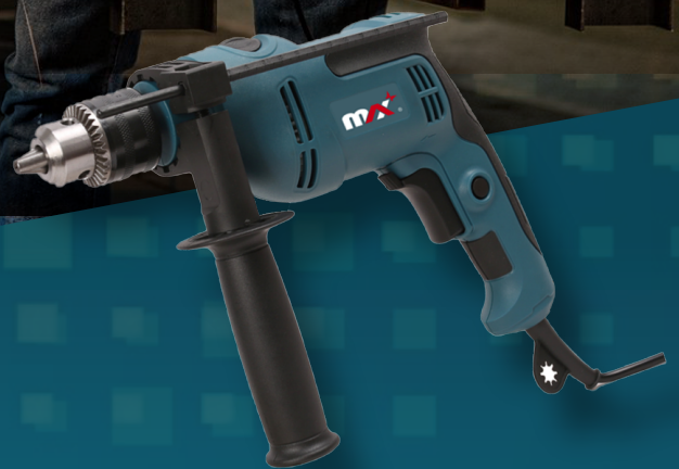
13mm Hammer Drill