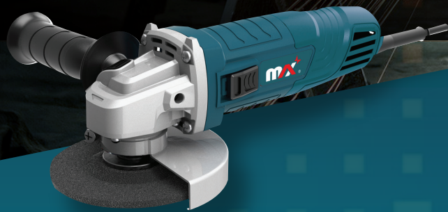
4" Small Angle Grinder